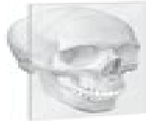
(a) Frontal (coronal)