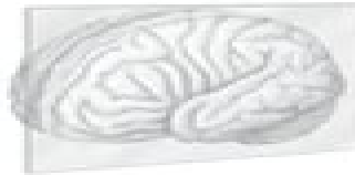
(b) Median (midsagittal)