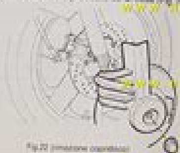
Fig. 22 (rimozione copridisco)

Freno anteriore mod. TOP MISTRALCI Per verificare lo stato del freno anteriore (operazione da effettuare ogni 2500 Km) smontare il copridisco (Fig. 22); quando la piastra nella parte inferiore si interverrà alle estremità delle pastiglie, il cui spessore minimo (del fondo) non dovrà essere inferiore a 2 mm, oppure verificare che siano ancora presenti le due scanalature praticate su di esse (Fig. 23).