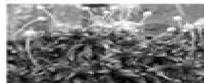
Moss gametophyte (a moss plant that is sensitive to the Western Cape)