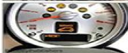
Step-by-step instructions for resetting CBS service items, 620 Maintenance