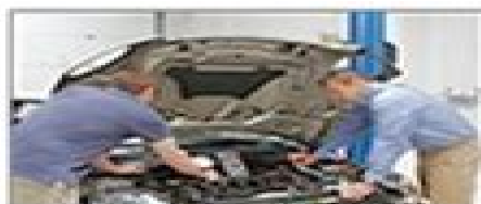
Bentley technician testing fuel pump on the Cooper S engine.

Though the do-it-yourself MINI owner will find this manual indispensable as a source of detailed maintenance and repair information, the owner who has no intention of working on his or her car will find that reading and owning this manual makes it possible to discuss repairs more intelligently with a professional technician.