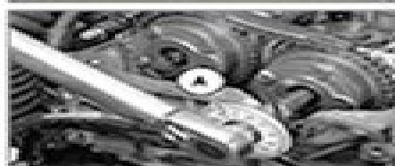
Detailed engine service, including VANOS camshaft timing adjustment N17 Camshaft Timing Chain