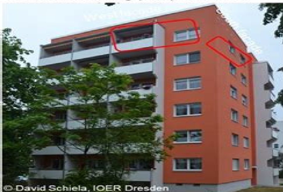
a Low-rise building (LRB): Side view