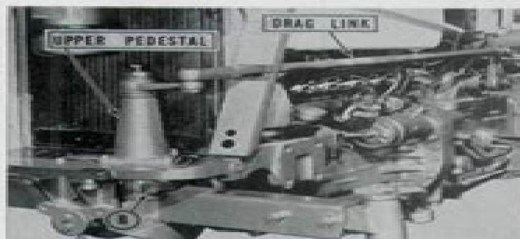
Fig. MF238—Upper pedestal and drag link installation on models F40, MH50 & MF50 equipped with manual steering and adjustable type front axle. The installation on tricycle models is similar except for details of the lower steering arm.

Remove pitman arm from lever shaft and remove the gear housing side cover (18—Fig. MF237). Withdraw the lever shaft and stud assembly. Examine the stud and renew same if damaged or excessively worn. Note: