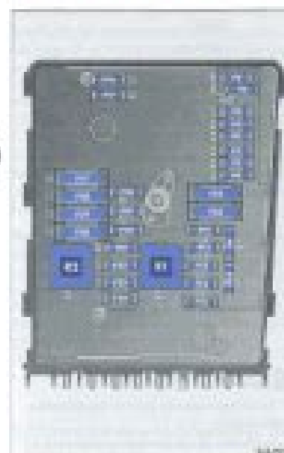
Fig. 41 Fusibles de la caja de fusibles del vano motor, Versión A (Low Box)