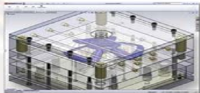
Mold design courtesy of R&B Mold and Design.

This issue of Mastercam Notes focuses on the new Mastercam for SolidWorks product by explaining exactly what it is, describing the process, and backing it up with a few customer testimonials. We hope you find this new product as exciting for your shop as we do!