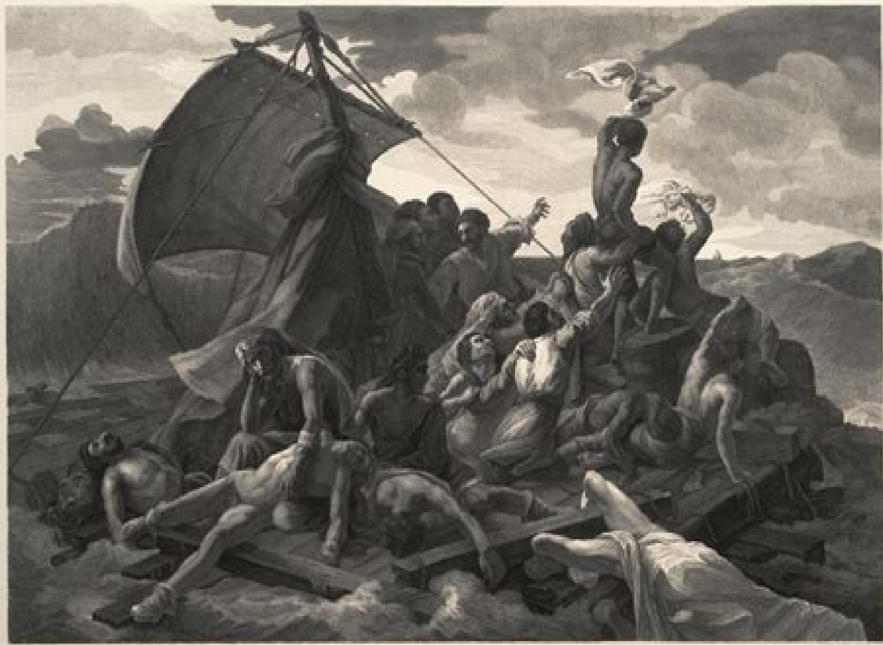
LE RADEAU DE LA MÉDUSE.