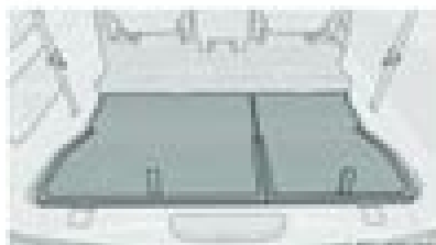
Stowed Third Row Seat