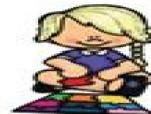
do a puzzle