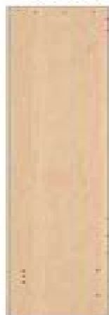
2 RIGHT BED-SIDE PANEL