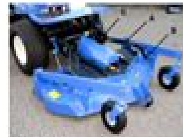
Fig. 1 LEFT ARM