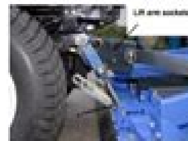
Fig. 2 Rotary Deck Mounting Plates