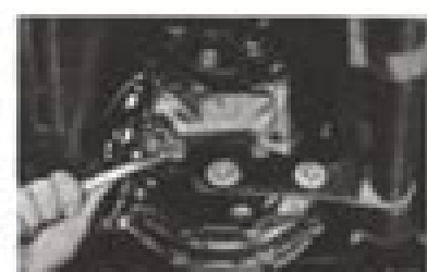
Fig. 3.4. Mounting the column pipe support bracket on the manual pressure