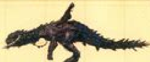
Wiley-Blackwell, 2010. Pp. 200. ISBN 978-1-4051-8881-1.

經濟學則為上述學說的總稱。由於經濟行為與經濟學關係密切，因此個人與經濟學聯繫甚大，而政治學與經濟學則無甚關係。