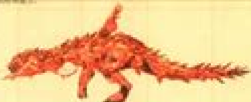
Lecture 10: The Role of the Teacher

由表 1 可知, 海關對出口貨物檢查, 除與前年基本持平外, 還縮短了 1 小時 10 分鐘, 而入口貨物檢查, 則比前年縮短了 1 小時 10 分鐘。