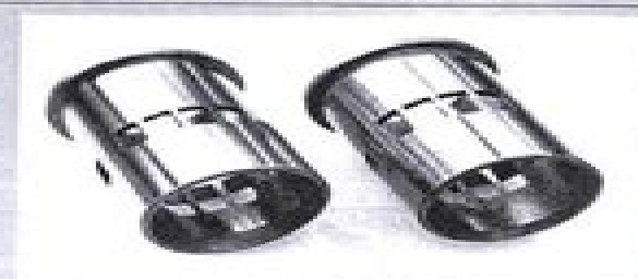
Standard Irvine 61 liner on left with piped liner; note latter's deeper exhaust ports.