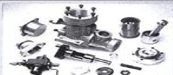
Parts of Irvine 61-RE. Engine uses investment casting for many components.