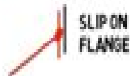
SLIP ON FLANGE