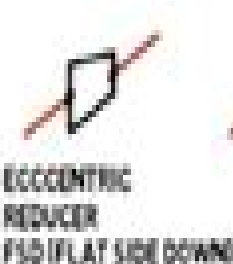
ECCENTRIC REDUCER FSD (FLAT SIDE DOWN)