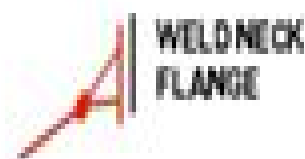
WELD NECK FLANGE