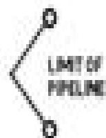
LIMIT OF PIPELINE