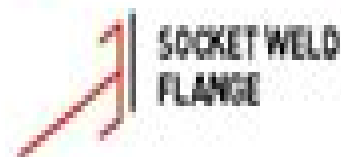
SOCKET WELD FLANGE