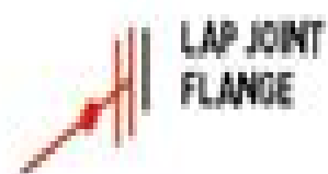
LAP JOINT FLANGE