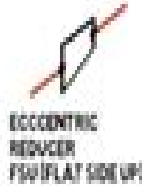
ECCENTRIC REDUCER FSU (FLAT SIDE UP)