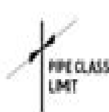
PIPE CLASS LIMIT