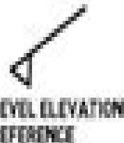
LEVEL ELEVATION REFERENCE