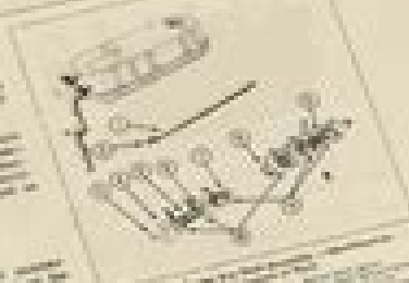
Fig. 1-5 Front View of the 400-122 Engine with Rocker Arm Shaft Assembly

The rocker arm shaft assembly is located on the front of the engine block. The rocker arm shaft assembly is a 12-digit number that identifies the engine.