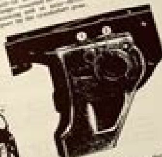
Fig. 1-4 Front View of the 400-122 Engine with Fuel Injection Pump

The fuel injection pump is driven by the engine and has a maximum output of 122 gpm. The fuel injection pump is designed to spray the fuel into the combustion chamber.