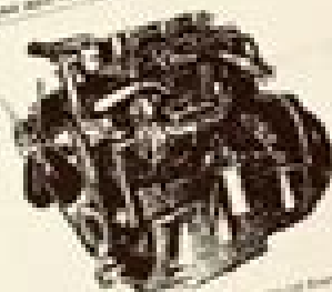
Fig. 1-1 Front View of the 400-122 Engine