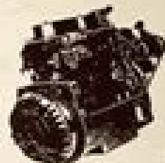
Fig. 1-3 Front View of the 400-122 Engine with Water Pump

The water pump is driven by the engine and has a maximum output of 122 gpm. The water pump is designed to circulate the cooling water through the engine and the radiator.