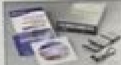
Model TrueView Recording 8.5GB and 4.7GB capacity, 16X Format DVD±R, DVD±R, DVD±R, DVD±R Disc 16X/10X/8X/6X/4X/3X/2X/1X Disc 16X/10X/8X/6X/4X/3X/2X/1X Disc 16X/10X/8X/6X/4X/3X/2X/1X Disc 16X/10X/8X/6X/4X/3X/2X/1X Disc 16X/10X/8X/6X/4X/3X/2X/1X

Model TrueView Recording 8.5GB and 4.7GB capacity, 16X Format DVD±R, DVD±R, DVD±R, DVD±R Disc 16X/10X/8X/6X/4X/3X/2X/1X Disc 16X/10X/8X/6X/4X/3X/2X/1X Disc 16X/10X/8X/6X/4X/3X/2X/1X Disc 16X/10X/8X/6X/4X/3X/2X/1X Disc 16X/10X/8X/6X/4X/3X/2X/1X Disc 16X/10X/8X/6X/4X/3X/2X/1X