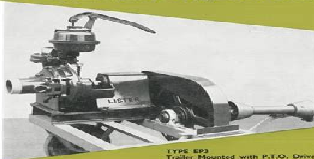
TYPE EP3 Trailer Mounted with P.T.O. Drive