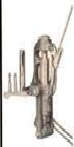
Model 2 (Throat Throat 18)