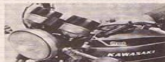
Checking fork oil level