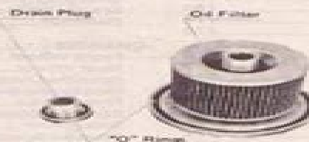
Oil filter and drain plug O-rings