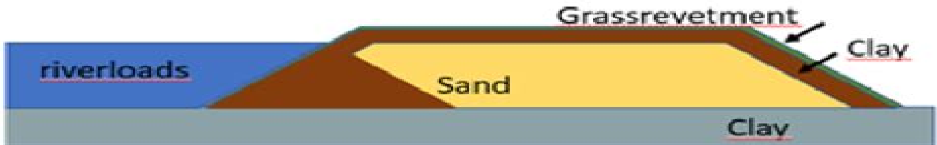
b) Delta dike