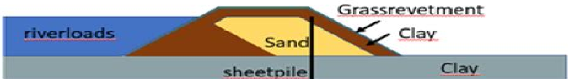
c) Ductile dike with sheetpile