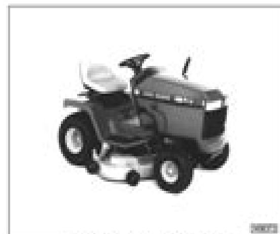
LX Series Lawn Tractor