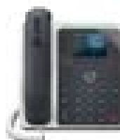
POLY EDGE E220