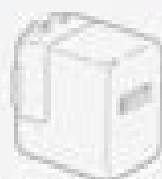
10W USB Power Adapter