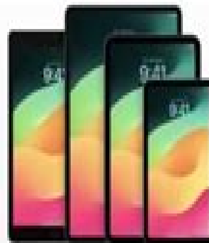
Table of Contents ⓘ