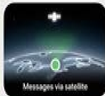
Messages via satellite