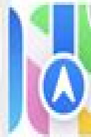
Larger icons on Home Screen