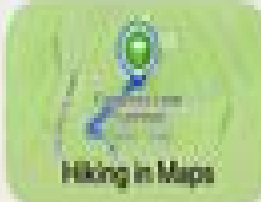
Hiking in Maps