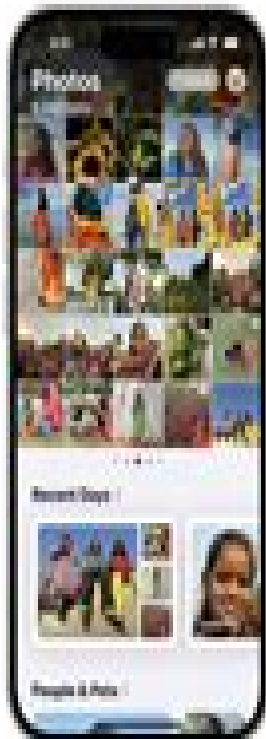
Biggest-ever Photos update