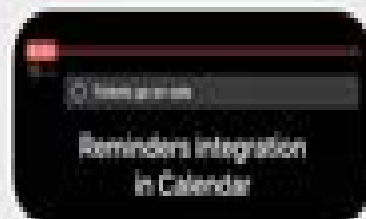
Reminders integration in Calendar