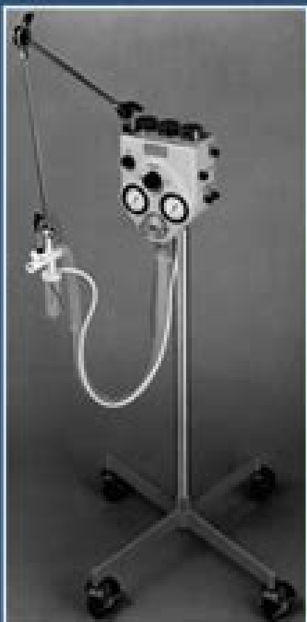
Copyright © 1999, 1995, 1991, 1988, 1985, 1982, 1979, 1976, 1973, 1970, 1967, 1964, 1961, 1958, 1955, 1952, 1949, 1946, 1943, 1940, 1937, 1934, 1931, 1928, 1925, 1922, 1919, 1916, 1913, 1910, 1907, 1904, 1901, 1898, 1895, 1892, 1889, 1886, 1883, 1880, 1877, 1874, 1871, 1868, 1865, 1862, 1859, 1856, 1853, 1850, 1847, 1844, 1841, 1838, 1835, 1832, 1829, 1826, 1823, 1820, 1817, 1814, 1811, 1808, 1805, 1802, 1799, 1796, 1793, 1790, 1787, 1784, 1781, 1778, 1775, 1772, 1769, 1766, 1763, 1760, 1757, 1754, 1751, 1748, 1745, 1742, 1739, 1736, 1733, 1730, 1727, 1724, 1721, 1718, 1715, 1712, 1709, 1706, 1703, 1700, 1697, 1694, 1691, 1688, 1685, 1682, 1679, 1676, 1673, 1670, 1667, 1664, 1661, 1658, 1655, 1652, 1649, 1646, 1643, 1640, 1637, 1634, 1631, 1628, 1625, 1622, 1619, 1616, 1613, 1610, 1607, 1604, 1601, 1598, 1595, 1592, 1589, 1586, 1583, 1580, 1577, 1574, 1571, 1568, 1565, 1562, 1559, 1556, 1553, 1550, 1547, 1544, 1541, 1538, 1535, 1532, 1529, 1526, 1523, 1520, 1517, 1514, 1511, 1508, 1505, 1502, 1499, 1496, 1493, 1490, 1487, 1484, 1481, 1478, 1475, 1472, 1469, 1466, 1463, 1460, 1457, 1454, 1451, 1448, 1445, 1442, 1439, 1436, 1433, 1430, 1427, 1424, 1421, 1418, 1415, 1412, 1409, 1406, 1403, 1400, 1397, 1394, 1391, 1388, 1385, 1382, 1379, 1376, 1373, 1370, 1367, 1364, 1361, 1358, 1355, 1352, 1349, 1346, 1343, 1340, 1337, 1334, 1331, 1328, 1325, 1322, 1319, 1316, 1313, 1310, 1307, 1304, 1301, 1298, 1295, 1292, 1289, 1286, 1283, 1280, 1277, 1274, 1271, 1268, 1265, 1262, 1259, 1256, 1253, 1250, 1247, 1244, 1241, 1238, 1235, 1232, 1229, 1226, 1223, 1220, 1217, 1214, 1211, 1208, 1205, 1202, 1199, 1196, 1193, 1190, 1187, 1184, 1181, 1178, 1175, 1172, 1169, 1166, 1163, 1160, 1157, 1154, 1151, 1148, 1145, 1142, 1139, 1136, 1133, 1130, 1127, 1124, 1121, 1118, 1115, 1112, 1109, 1106, 1103, 1100, 1097, 1094, 1091, 1088, 1085, 1082, 1079, 1076, 1073, 1070, 1067, 1064, 1061, 1058, 1055, 1052, 1049, 1046, 1043, 1040, 1037, 1034, 1031, 1028, 1025, 1022, 1019, 1016, 1013, 1010, 1007, 1004, 1001, 998, 995, 992, 989, 986, 983, 980, 977, 974, 971, 968, 965, 962, 959, 956, 953, 950, 947, 944, 941, 938, 935, 932, 929, 926, 923, 920, 917, 914, 911, 908, 905, 902, 899, 896, 893, 890, 887, 884, 881, 878, 875, 872, 869, 866, 863, 860, 857, 854, 851, 848, 845, 842, 839, 836, 833, 830, 827, 824, 821, 818, 815, 812, 809, 806, 803, 800, 797, 794, 791, 788, 785, 782, 779, 776, 773, 770, 767, 764, 761, 758, 755, 752, 749, 746, 743, 740, 737, 734, 731, 728, 725, 722, 719, 716, 713, 710, 707, 704, 701, 698, 695, 692, 689, 686, 683, 680, 677, 674, 671, 668, 665, 662, 659, 656, 653, 650, 647, 644, 641, 638, 635, 632, 629, 626, 623, 620, 617, 614, 611, 608, 605, 602, 599, 596, 593, 590, 587, 584, 581, 578, 575, 572, 569, 566, 563, 560, 557, 554, 551, 548, 545, 542, 539, 536, 533, 530, 527, 524, 521, 518, 515, 512, 509, 506, 503, 500, 497, 494, 491, 488, 485, 482, 479, 476, 473, 470, 467, 464, 461, 458, 455, 452, 449, 446, 443, 440, 437, 434, 431, 428, 425, 422, 419, 416, 413, 410, 407, 404, 401, 398, 395, 392, 389, 386, 383, 380, 377, 374, 371, 368, 365, 362, 359, 356, 353, 350, 347, 344, 341, 338, 335, 332, 329, 326, 323, 320, 317, 314, 311, 308, 305, 302, 299, 296, 293, 290, 287, 284, 281, 278, 275, 272, 269, 266, 263, 260, 257, 254, 251, 248, 245, 242, 239, 236, 233, 230, 227, 224, 221, 218, 215, 212, 209, 206, 203, 200, 197, 194, 191, 188, 185, 182, 179, 176, 173, 170, 167, 164, 161, 158, 155, 152, 149, 146, 143, 140, 137, 134, 131, 128, 125, 122, 119, 116, 113, 110, 107, 104, 101, 98, 95, 92, 89, 86, 83, 80, 77, 74, 71, 68, 65, 62, 59, 56, 53, 50, 47, 44, 41, 38, 35, 32, 29, 26, 23, 20, 17, 14, 11, 8, 5, 2, 1, 0, -1, -2, -3, -4, -5, -6, -7, -8, -9, -10, -11, -12, -13, -14, -15, -16, -17, -18, -19, -20, -21, -22, -23, -24, -25, -26, -27, -28, -29, -30, -31, -32, -33, -34, -35, -36, -37, -38, -39, -40, -41, -42, -43, -44, -45, -46, -47, -48, -49, -50, -51, -52, -53, -54, -55, -56, -57, -58, -59, -60, -61, -62, -63, -64, -65, -66, -67, -68, -69, -70, -71, -72, -73, -74, -75, -76, -77, -78, -79, -80, -81, -82, -83, -84, -85, -86, -87, -88, -89, -90, -91, -92, -93, -94, -95, -96, -97, -98, -99, -100, -101, -102, -103, -104, -105, -106, -107, -108, -109, -110, -111, -112, -113, -114, -115, -116, -117, -118, -119, -120, -121, -122, -123, -124, -125, -126, -127, -128, -129, -130, -131, -132, -133, -134, -135, -136, -137, -138, -139, -140, -141, -142, -143, -144, -145, -146, -147, -148, -149, -150, -151, -152, -153, -154, -155, -156, -157, -158, -159, -160, -161, -162, -163, -164, -165, -166, -167, -168, -169, -170, -171, -172, -173, -174, -175, -176, -177, -178, -179, -180, -181, -182, -183, -184, -185, -186, -187, -188, -189, -190, -191, -192, -193, -194, -195, -196, -197, -198, -199, -200, -201, -202, -203, -204, -205, -206, -207, -208, -209, -210, -211, -212, -213, -214, -215, -216, -217, -218, -219, -220, -221, -222, -223, -224, -225, -226, -227, -228, -229, -230, -231, -232, -233, -234, -235, -236, -237, -238, -239, -240, -241, -242, -243, -244, -245, -246, -247, -248, -249, -250, -251, -252, -253, -254, -255, -256, -257, -258, -259, -260, -261, -262, -263, -264, -265, -266, -267, -268, -269, -270, -271, -272, -273, -274, -275, -276, -277, -278, -279, -280, -281, -282, -283, -284, -285, -286, -287, -288, -289, -290, -291, -292, -293, -294, -295, -296, -297, -298, -299, -300, -301, -302, -303, -304, -305, -306, -307, -308, -309, -310, -311, -312, -313, -314, -315, -316, -317, -318, -319, -320, -321, -322, -323, -324, -325, -326, -327, -328, -329, -330, -331, -332, -333, -334, -335, -336, -337, -338, -339, -340, -341, -342, -343, -344, -345, -346, -347, -348, -349, -350, -351, -352, -353, -354, -355, -356, -357, -358, -359, -360, -361, -362, -363, -364, -365, -366, -367, -368, -369, -370, -371, -372, -373, -374, -375, -376, -377, -378, -379, -380, -381, -382, -383, -384, -385, -386, -387, -388, -389, -390, -391, -392, -393, -394, -395, -396, -397, -398, -399, -400, -401, -402, -403, -404, -405, -406, -407, -408, -409, -410, -411, -412, -413, -414, -415, -416, -417, -418, -419, -420, -421, -422, -423, -424, -425, -426, -427, -428, -429, -430, -431, -432, -433, -434, -435, -436, -437, -438, -439, -440, -441, -442, -443, -444, -445, -446, -447, -448, -449, -450, -451, -452, -453, -454, -455, -456, -457, -458, -459, -460, -461, -462, -463, -464, -465, -466, -467, -468, -469, -470, -471, -472, -473, -474, -475, -476, -477, -478, -479, -480, -481, -482, -483, -484, -485, -486, -487, -488, -489, -490, -491, -492, -493, -494, -495, -496, -497, -498, -499, -500, -501, -502, -503, -504, -505, -506, -507, -508, -509, -510, -511, -512, -513, -514, -515, -516, -517, -518, -519, -520, -521, -522, -523, -524, -525, -526, -527, -528, -529, -530, -531, -532, -533, -534, -535, -536, -537, -538, -539, -540, -541, -542, -543, -544, -545, -546, -547, -548, -549, -550, -551, -552, -553, -554, -555, -556, -557, -558, -559, -560, -561, -562, -563, -564, -565, -566, -567, -568, -569, -570, -571, -572, -573, -574, -575, -576, -577, -578, -579, -580, -581, -582, -583, -584, -585, -586, -587, -588, -589, -590, -591, -592, -593, -594, -595, -596, -597, -598, -599, -600, -601, -602, -603, -604, -605, -606, -607, -608, -609, -610, -611, -612, -613, -614, -615, -616, -617, -618, -619, -620, -621, -622, -623, -624, -625, -626, -627, -628, -629, -630, -631, -632, -633, -634, -635, -636, -637, -638, -639, -640, -641, -642, -643, -644, -645, -646, -647, -648, -649, -650, -651, -652, -653, -654, -655, -656, -657, -658, -659, -660, -661, -662, -663, -664, -665, -666, -667, -668, -669, -670, -671, -672, -673, -674, -675, -676, -677, -678, -679, -680, -681, -682, -683, -684, -685, -686, -687, -688, -689, -690, -691, -692, -693, -694, -695, -696, -697, -698, -699, -700, -701, -702, -703, -704, -705, -706, -707, -708, -709, -710, -711, -712, -713, -714, -715, -716, -717, -718, -719, -720, -721, -722, -723, -724, -725, -726, -727, -728, -729, -730, -731, -732, -733, -734, -735, -736, -737, -738, -739, -740, -741, -742, -743, -744, -745, -746, -747, -748, -749, -750, -751, -752, -753, -754, -755, -756, -757, -758, -759, -760, -761, -762, -763, -764, -765, -766, -767, -768, -769, -770, -771, -772, -773, -774, -775, -776, -777, -778, -779, -780, -781, -782, -783, -784, -785, -786, -787, -788, -789, -790, -791, -792, -793, -794, -795, -796, -797, -798, -799, -800, -801, -802, -803, -804, -805, -806, -807, -808, -809, -810, -811, -812, -813, -814, -815, -816, -817, -818, -819, -820, -821, -822, -823, -824, -825, -826, -827, -828, -829, -830, -831, -832, -833, -834, -835, -836, -837, -838, -839, -840, -841, -842, -843, -844, -845, -846, -847, -848, -849, -850, -851, -852, -853, -854, -855, -856, -857, -858, -859, -860, -861, -862, -863, -864, -865, -866, -867, -868, -869, -870, -871, -872, -873, -874, -875, -876, -877, -878, -879, -880, -881, -882, -883, -884, -885, -886, -887, -888, -889, -890, -891, -892, -893, -894, -895, -896, -897, -898, -899, -900, -901, -902, -903, -904, -905, -906, -907, -908, -909, -910, -911, -912, -913, -914, -915, -916, -917, -918, -919, -920, -921, -922, -923, -924, -925, -926, -927, -928, -929, -930, -931, -932, -933, -934, -935, -936, -937, -938, -939, -940, -941, -942, -943, -944, -945, -946, -947, -948, -949, -950, -951, -952, -953, -954, -955, -956, -957, -958, -959, -960, -961, -962, -963, -964, -965, -966, -967, -968, -969, -970, -971, -972, -973, -974, -975, -976, -977, -978, -979, -980, -981, -982, -983, -984, -985, -986, -987, -988, -989, -990, -991, -992, -993, -994, -995, -996, -997, -998, -999, -1000, -1001, -1002, -1003, -1004, -1005, -1006, -1007, -1008, -1009, -1010, -1011, -1012, -1013, -1014, -1015, -1016, -1017, -1018, -1019, -1020, -1021, -1022, -1023, -1024, -1025, -1026, -1027, -1028, -1029, -1030, -1031, -1032, -1033, -1034, -1035, -1036, -1037, -1038, -1039, -1040, -1041, -1042, -1043, -1044, -1045, -1046, -1047, -1048, -1049, -1050, -1051, -1052, -1053, -1054, -1055, -1056, -1057, -1058, -1059, -1060, -1061, -1062, -1063, -1064, -1065, -1066, -1067, -1068, -1069, -1070, -1071, -1072, -1073, -1074, -1075, -1076, -1077, -1078, -1079, -1080, -1081, -1082, -1083, -1084, -1085, -1086, -1087, -1088, -1089, -1090, -1091, -1092, -1093, -1094, -1095, -1096, -1097, -1098, -1099, -1100, -1101, -1102, -1103, -1104, -1105, -1106, -1107, -1108, -1109, -1110, -1111, -1112, -1113, -1114, -1115, -1116, -1117, -1118, -1119, -1120, -1121, -1122, -1123, -1124, -1125, -1126, -1127, -1128, -1129, -1130, -1131, -1132, -1133, -1134, -1135, -1136, -1137, -1138, -1139, -1140, -1141, -1142, -1143, -1144, -1145, -1146, -1147, -1148, -1149, -1150, -1151, -1152, -1153, -1154, -1155, -1156, -1157, -1158, -1159, -1160, -1161, -1162, -1163, -1164, -1165, -1166, -1167, -1168, -1169, -1170, -1171, -1172, -1173, -1174, -1175, -1176, -1177, -1178, -1179, -1180, -1181, -1182, -1183, -1184, -1185, -1186, -1187, -1188, -1189, -1190, -1191, -1192, -1193, -1194, -1195, -1196, -1197, -1198, -1199, -1200, -1201, -1202, -1203, -1204, -1205, -1206, -1207, -1208, -1209, -1210, -1211, -1212, -1213, -1214, -1215, -1216, -1217, -1218, -1219, -1220, -1221, -1222, -1223, -1224, -1225, -1226, -1227, -1228, -1229, -1230, -1231, -1232, -1233, -1234, -1235, -1236, -1237, -1238, -1239, -1240, -1241, -1242, -1243, -1244, -1245, -1246, -1247, -1248, -1249, -1250, -1251, -1252, -1253, -1254, -1255, -1256, -1257, -1258, -1259, -1260, -1261, -1262, -1263, -1264, -1265, -1266, -1267, -1268, -1269, -1270, -1271, -1272, -1273, -1274, -1275, -1276, -1277, -1278, -1279, -1280, -1281, -1282, -1283, -1284, -1285, -1286, -1287, -1288, -1289, -1290, -1291, -1292, -1293, -1294, -1295, -1296, -1297, -1298, -1299, -1300, -1301, -1302, -1303, -1304, -1305, -1306, -1307, -1308, -1309, -1310, -1311, -1312, -1313, -1314, -1315, -1316, -1317, -1318, -1319, -1320, -1321, -1322, -1323, -1324, -1325, -1326, -1327, -1328, -1329, -1330, -1331, -1332, -1333, -1334, -1335, -1336, -1337, -1338, -1339, -1340, -1341, -1342, -1343, -1344, -1345, -1346, -1347, -1348, -1349, -1350, -1351, -1352, -1353, -1354, -1355, -1356, -1357, -1358, -1359, -1360, -1361, -1362, -1363, -1364, -1365, -1366, -1367, -1368, -1369, -1370, -1371, -1372, -1373, -1374, -1375, -1376, -1377, -1378, -1379, -1380, -1381, -1382, -1383, -1384, -1385, -1386, -1387, -1388, -1389, -1390, -1391, -1392, -1393, -1394, -1395, -1396, -1397, -1398, -1399, -1400, -1401, -1402, -1403, -1404, -1405, -1406, -1407, -1408, -1409, -1410, -1411, -1412, -1413, -1414, -1415, -1416, -1417, -1418, -1419, -1420, -1421, -1422, -1423, -1424, -1425, -1426, -1427, -1428, -1429, -1430, -1431, -1432, -1433, -1434, -1435, -1436, -1437, -1438, -1439, -1440, -1441, -1442, -1443, -1444, -1445, -1446, -1447, -1448, -1449, -1450, -1451, -1452, -1453, -1454, -1455, -1456, -1457, -1458, -1459, -1460, -1461, -1462, -1463, -1464, -1465, -1466, -1467, -1468, -1469, -1470, -1471, -1472, -1473, -1474, -1475, -1476, -1477, -1478, -1479, -1480, -1481, -1482, -1483, -1484, -1485, -1486, -1487, -1488, -1489, -1490, -1491, -1492, -1493, -1494, -1495, -1496, -1497, -1498, -1499, -1500, -1501, -1502, -1503, -1504, -1505, -1506, -1507, -1508, -1509, -1510, -1511, -1512, -1513, -1514, -1515, -1516, -1517, -1518, -1519, -1520, -1521, -1522, -1523, -1524, -1525, -1526, -1527, -1528, -1529, -1530, -1531, -1532, -1533, -1534, -1535, -1536, -1537, -1538, -1539, -1540, -1541, -1542, -1543, -1544, -1545, -1546, -1547, -1548, -1549, -1550, -1551, -1552, -1553, -1554, -1555, -1556, -1557, -1558, -1559, -1560, -1561, -1562, -1563, -1564, -1565, -1566, -1567, -1568, -1569, -1570, -1571, -1572, -1573, -1574, -1575, -1576, -1577, -1578, -1579, -1580, -1581, -1582, -1583, -1584, -1585, -1586, -1587, -1588, -1589, -1