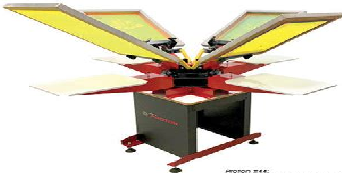
Proton 244: 4-Color, 4-Station, with optional floor stand