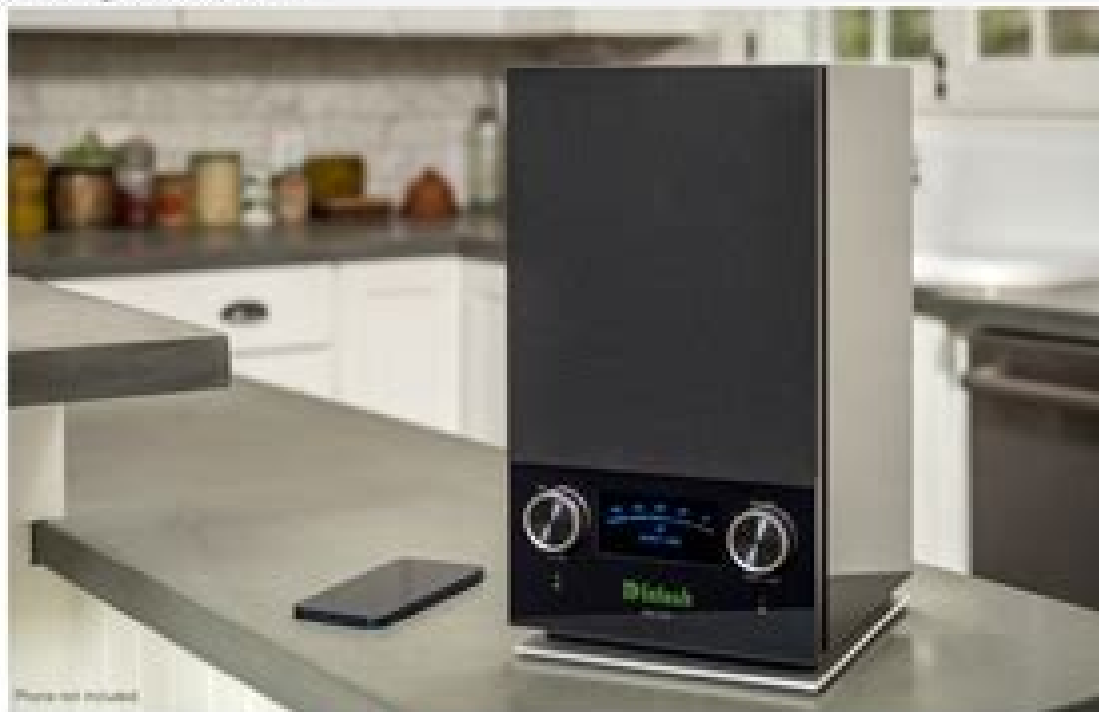
Phone not included

* Requires use of a third-party Google Assistant device with voice input built separately. The RS150 and Google Assistant device must be on the same network.