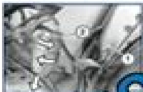
Remove the alternator (1) and the alternator (2).

Remove the alternator (1) and the alternator (2). Tighten torque (1) 10 Nm Tighten torque (2) 10 Nm