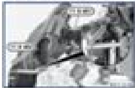
Apply special tool (1) and (2).

Remove mounting bolt (1) for the alternator and remove the alternator (2) with the alternator (3) at the coolant hose. Remove mounting bolt (1) for the alternator (2) and the alternator (3). Remove the alternator (2) and the alternator (3). Tighten torque (1) 10 Nm Tighten torque (2) 10 Nm Tighten torque (3) 10 Nm