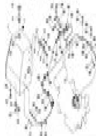
THE 2011 RESEARCHER'S COMPANION | THE 2011 RESEARCHER'S COMPANION RESEARCHER'S COMPANION