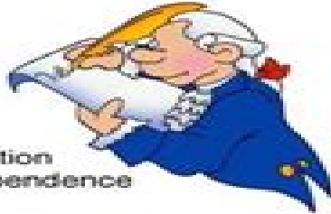
Declaration of Independence 1776