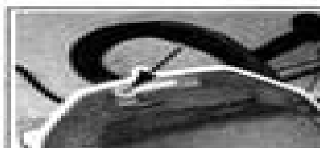
Fig. 9 If equipped, use the grease fittings normally found at the front ...

■ Do not attempt to just grasp the vent hose and pull, as it is a tight fit and when it does come off, you'll probably get tying if you didn't prepare for it. The easier method of removing the vent hose from the fitting is to deflex the hose to one side and wring it free from the fitting.