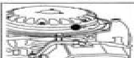
Fig. 8 In most cases, models that require periodic lubrication provide easy access to the starter pinion