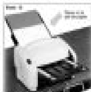
Figure 1 Top view of the machine