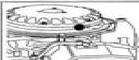
Fig. 8 In most cases, models that require periodic lubrication grease may access to the starter pinion