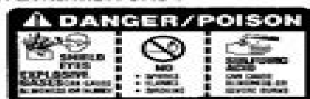
(2) Part No. K1211-6116-1