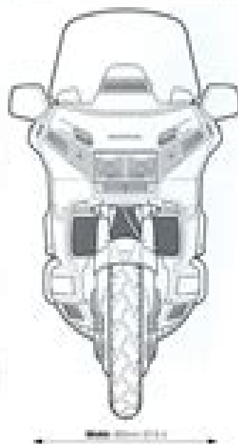
Wheelbase: 1495mm (59.0")