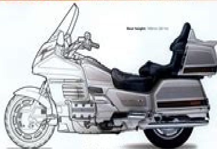
Seat height: 760mm (30.0")