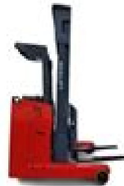
Electric Reach Truck