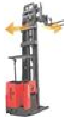
pallet stacker/ Very Narrow Aisle Forklift