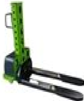
self loading forklift