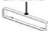
Mounting hardware Assy (J21-9716-03)