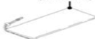
* Remote controller Assy (RC-557) (A70-2087-05)