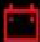
Generator warning light