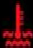
Engine overheat warning light