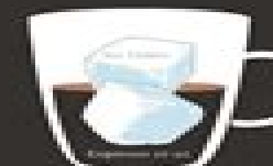
CAFÉ CON HIELO