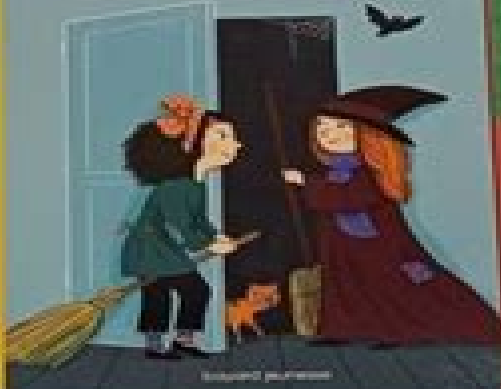
Illustration par Fabrice Colin