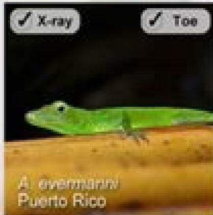
A. evermanni Puerto Rico