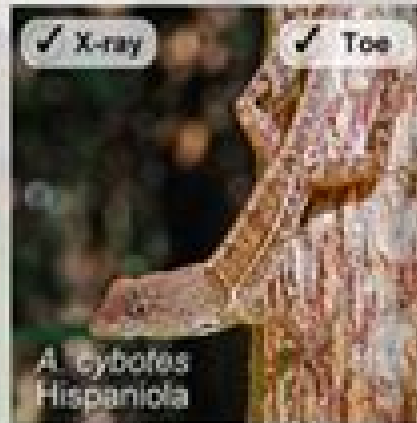
A. cybotes Hispaniola