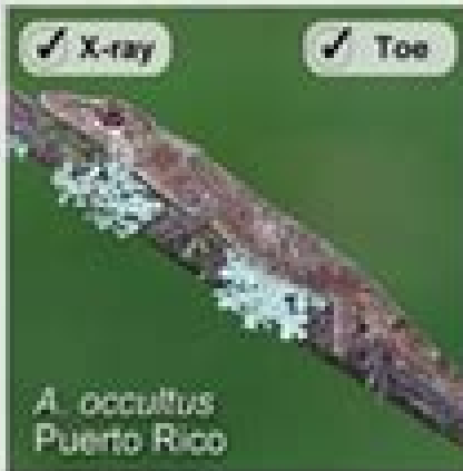
A. occultus Puerto Rico