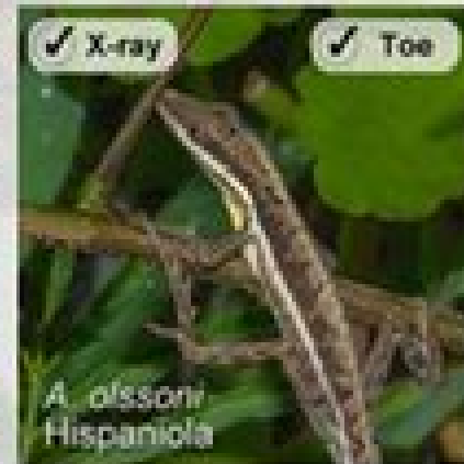
A. olssoni Hispaniola

Press each lizard photo above to measure. You can review how to take measurements by pressing on the "Tutorials" tab.