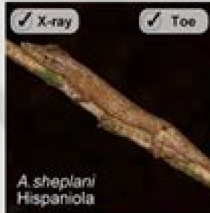
A. sheplani Hispaniola