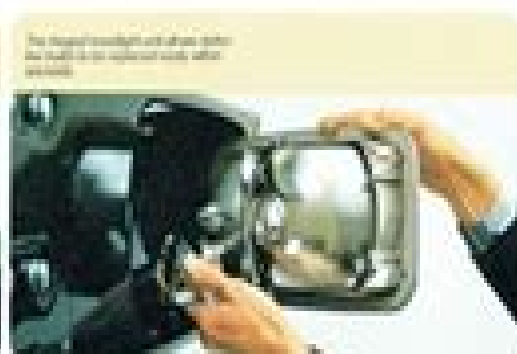
The integral headlight unit allows easy access to the important parts when the cab is tilted.