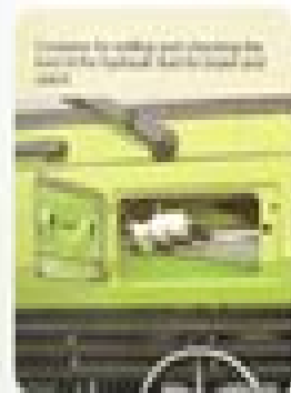
Convenient entry and egress by means of hydraulic door control and lock.