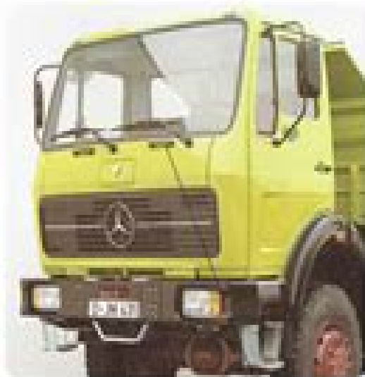
Large doors and glass facilitates driver's entry to the cab and access to other features.