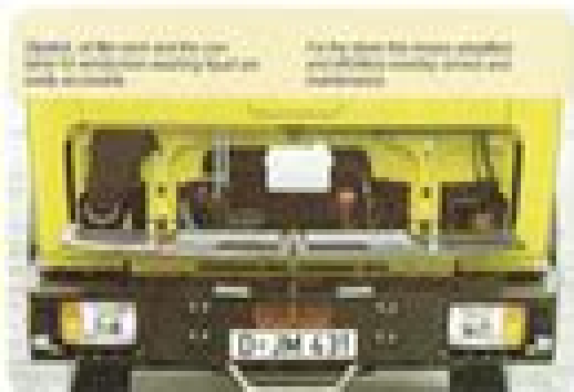
Spacious, air-filled seat and the rear window with electrically heating glass are easily accessible.