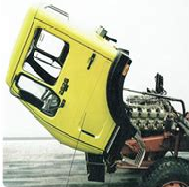
The cab can be tilted backwards by a hydraulic drive with pressure control, even when the vehicle is in motion or stopped.