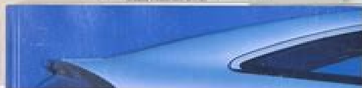
C-Class Sports Coupe Operator's Manual