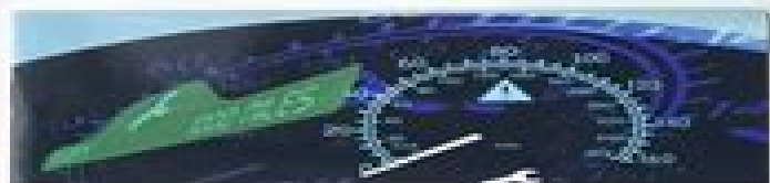
Service Booklet Passenger Cars