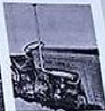
Figure 1. The effect of the concentration of the inhibitor on the rate of polymerization.

A standard way to produce an in vitro neuronal effect. This can be accomplished with very minimal inputs and means that it does not require any of the complex neuronal mechanisms that underlie the effect.