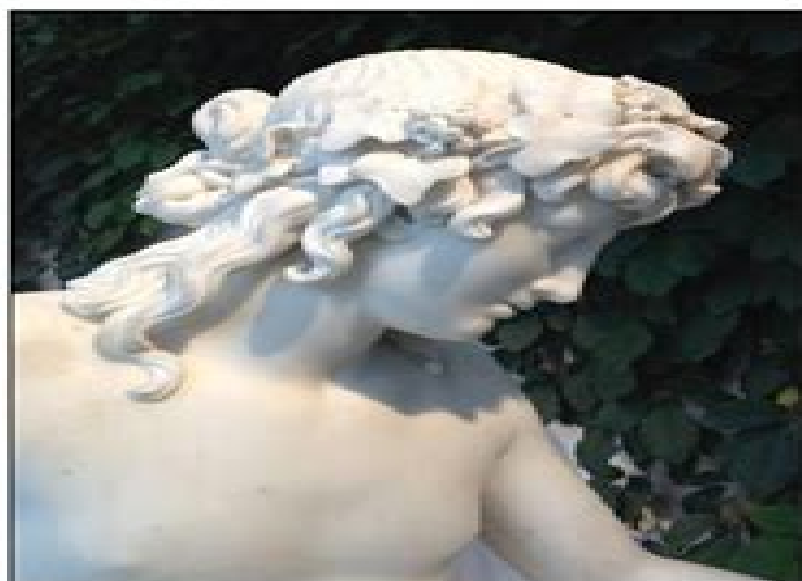
Bacchus by Erik Gustaf Göthe, 1808 - creative commons