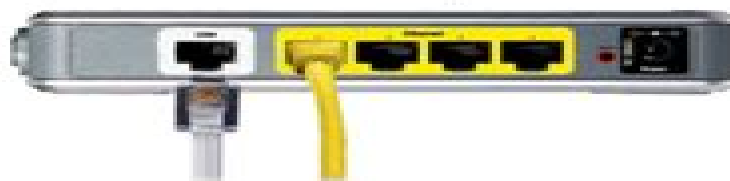
Connect the DSL