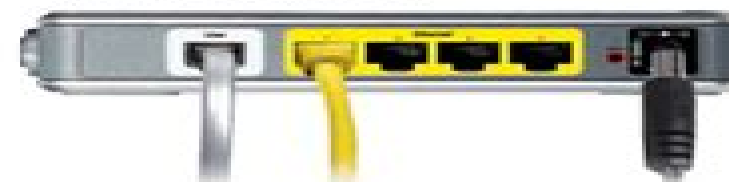
Connect the Power